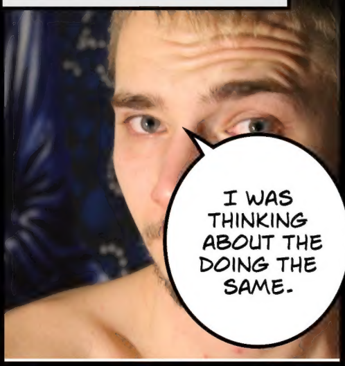
MEANWHILE AT INTERNET'S RESEARCH AGENCY HQ---

I WAS THINKING ABOUT THE DOING THE SAME.